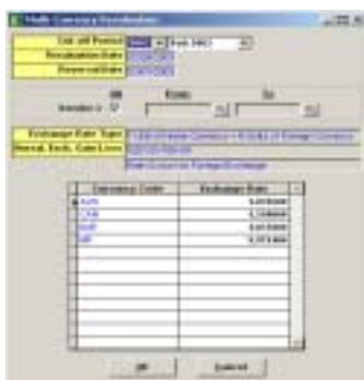
Figure 3. Multi-Currency Revaluation Function

When multi-currency is activated, a currency code can be assigned to each vendor, providing billing in the appropriate currency. AccountMate's Multi-Currency also provides the ability to compute the unrealized gains or losses for these transactions. Foreign currency accounts payable can be revalued to a specific currency revaluation date as currency rates fluctuate.