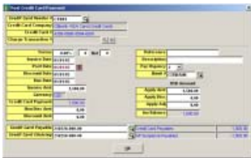
Figure 2. AP Invoice Transaction - Post Credit Card Payment Window

Credit cards are a payment option when posting an Accounts Payable invoice. You can automatically transfer balances to a credit card company and assign transaction numbers to the balance transferred for better control and tracking. Journal entries are generated to reclassify the payable balance from the original vendor to the credit card company. AccountMate generates a voucher for the original vendor, but the check will be payable to the credit card company.