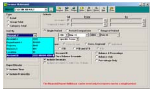
Figure 4. Income Statement - Report Interface

Financial statements can be prepared for individual, combined or consolidated departments, projects, divisions, etc., depending on how account segment types have been set up. Also, you can elect to show account balances in period-to-date or year-to-date formats.