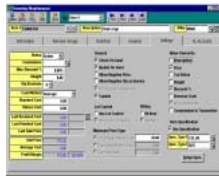
Figure 2. Price Control and Inventory Item Specification

When the Price Control features are integrated with the Inventory Item Specification module's powerful features, you can create a multi-layered pricing structure by Inventory Types and Codes, such as size and color. The Price Control and Inventory Item Specification modules work hand-in-hand to provide inventory and pricing structures customized to your particular needs.