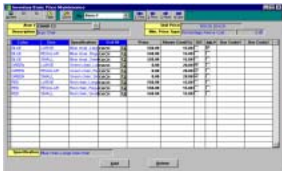
Figure 1. Inventory Basic Price Maintenance

Unit and Multi-Level prices can be created in one location, Inventory Basic Price Maintenance. This feature enables you to establish Unit and Basic prices and unlimited Multi-Level prices by Price Code and Quantity for inventory items.