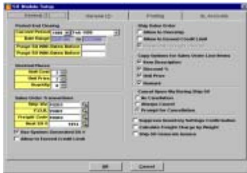
Sales Order Module Setup

Within the Sales Order module, you can set up a currency code for each currency in which you will - or might - transact business. Customers can each be assigned a different currency code, allowing your orders to be placed in their specific currency. Either the latest inventory price or the last price billed in the same currency can be used when creating sales orders.